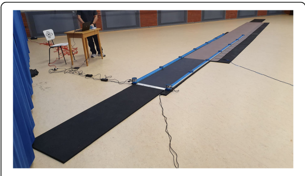
Fig. 2 Measurement setup of the overground walking systems Zebris, OptoGait and GAlTrite

Zebris (2 m), as well as two mats (each of 2 m length) positioned on both ends of the walkway with the same height as GAITrite, to consider gait initiation and gait termination on an even surface. The walkway (between OptoGait bars) was limited to a width of 0.6 m, corresponding to the width of the Zebris system. Upon arrival in the gym of the Institute of Sports Sciences at the University of Hamburg, where the study was conducted, the participants were informed about the content of the study and signed a declaration of consent. Afterwards the height, weight, leg length (left and right) and shoe size were measured. Then the acceleration sensors were attached (see Fig. 1). Waiting at the starting position the test person was instructed and the walking conditions were described.