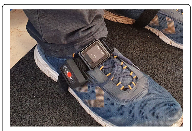
Fig. 1 Image showing the attachment of the inertial sensors of GaitUp and MobilityLab

Figure 2 shows the measurement setup of the systems, illustrating that the gait paths of the different systems overlap only partially. The overall length of the walkway setup was 14.7 m. This is the sum of the distances of the overground walking systems GAITrite (8.7 m) and