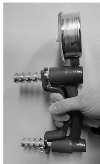
Task-specific grip setting for task-specific grip strength and endurance.